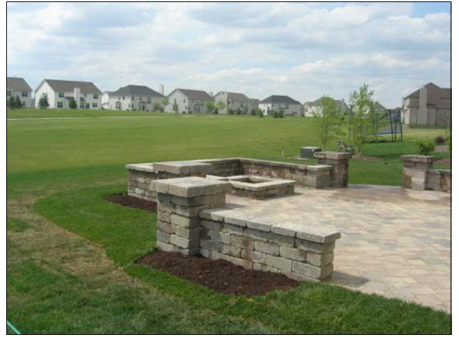
Backs 2 Linear Park That Goes 2 Playground