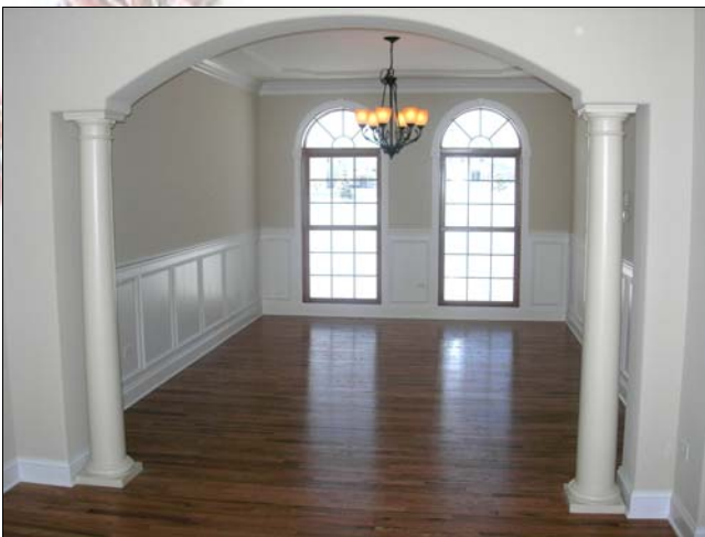
Huge Dining Room w/Hardwood Floors