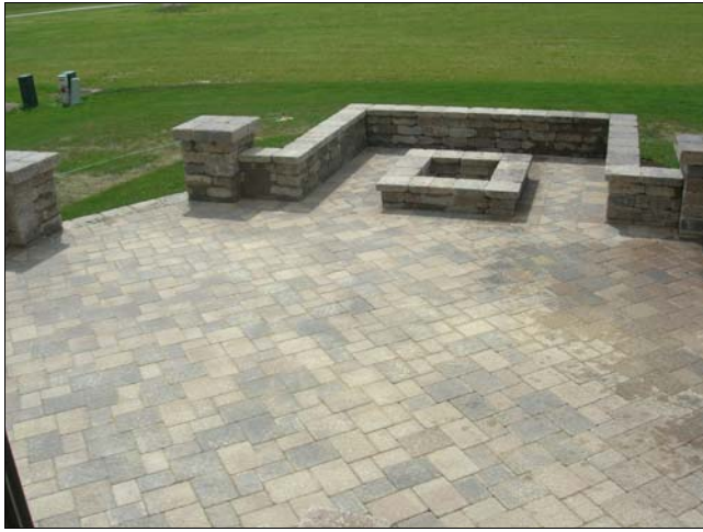
Paver Brick Patio w/ Built-In Firepit