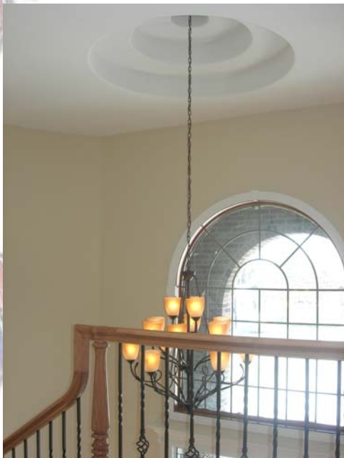
Custom Curved Staircase w/Iron Spindles