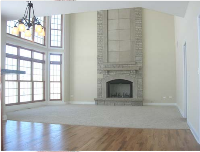
View From Kitchen Towards Family Rm