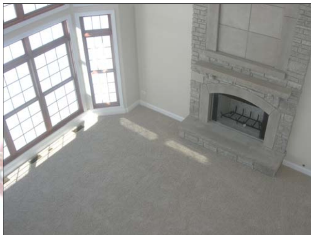
View From Balcony Into Family Room