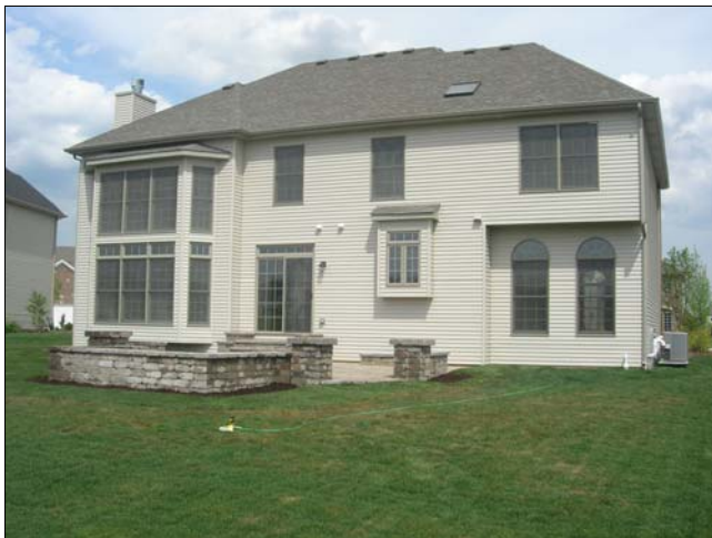
Two Story Bay Windows In Family Room