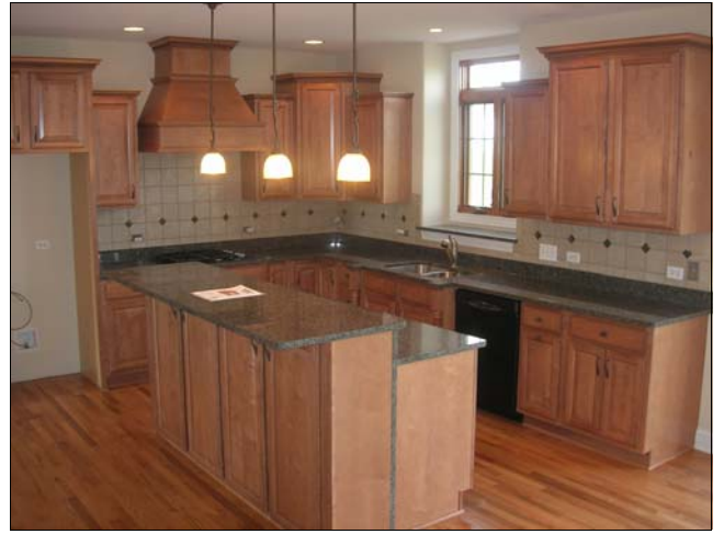
Built-In Appl's & Granite Counter Tops