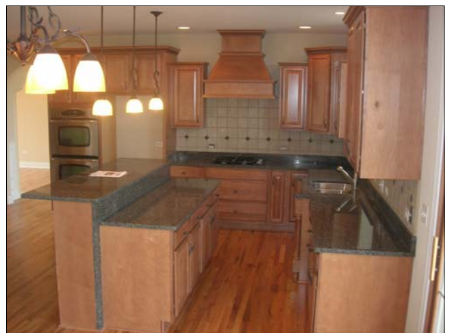
Another View Of Kitchen