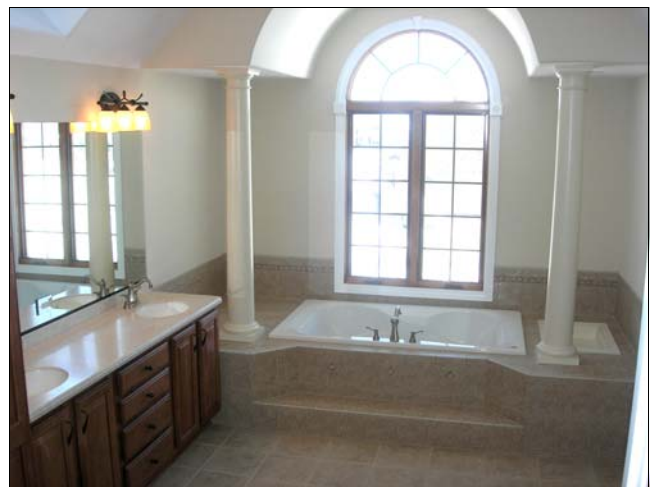
Step Down Master Bath w/Walk-In Shower