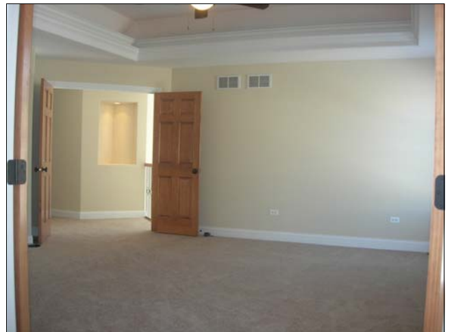
MBR w/ Lighted Tray Ceiling